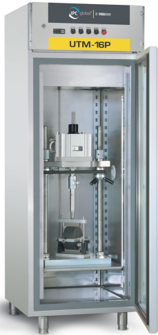
Servo-pneumatic Universal Testing Machine UTM, 16 kN cap.