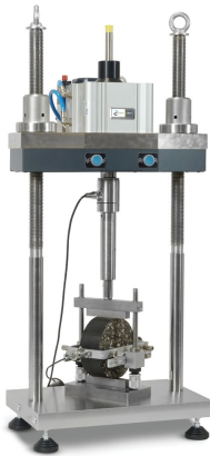
UTM-16P without climatic chamber, fitted with indirect tensile jig

Load capacity: 16 kN Load cell: +/- 20 kN capacity Max frequency: 30 Hz Double effect servo-pneumatic actuator, 30 mm stroke Actuator with 30 mm in-built displacement transducer Vertical space: 650 mm Space between columns: 339 mm Dimensions (w x d x h): 480 x 300 x 1200 mm Weight (approx.): 200 kg